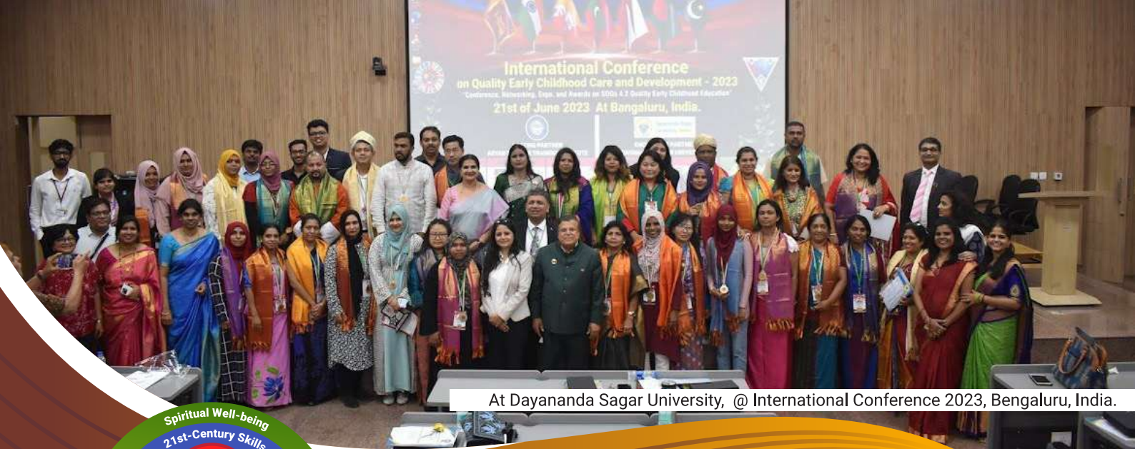
At Dayananda Sagar University, @ International Conference 2023, Bengaluru, India.