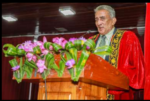
Memories of the International Conference 2023, Colombo, Sri Lanka