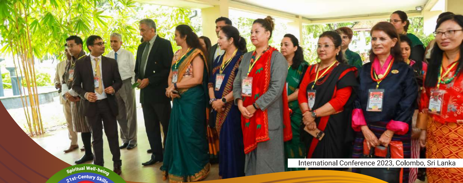
International Conference 2023, Colombo, Sri Lanka