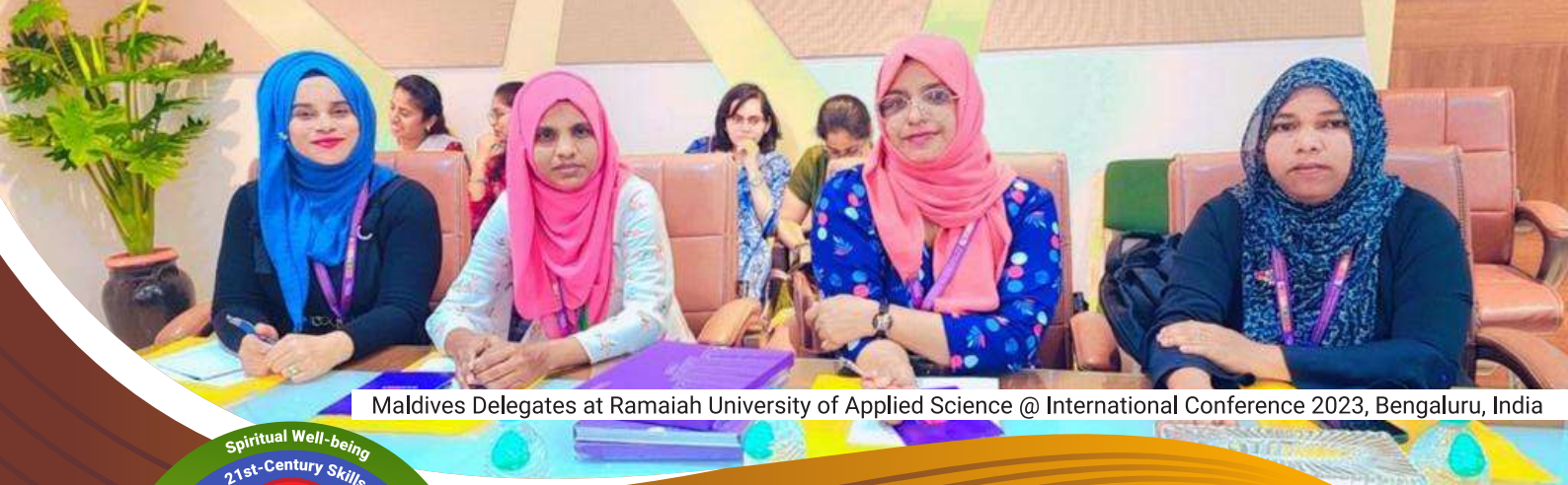
Maldives Delegates at Ramaiah University of Applied Science @ International Conference 2023, Bengaluru, India