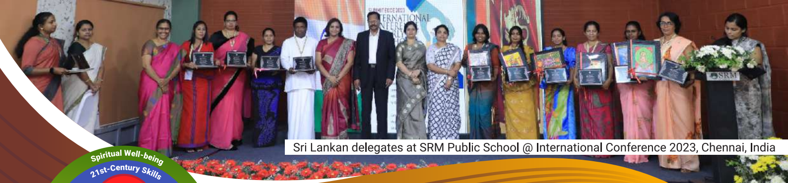
Sri Lankan delegates at SRM Public School @ International Conference 2023, Chennai, India