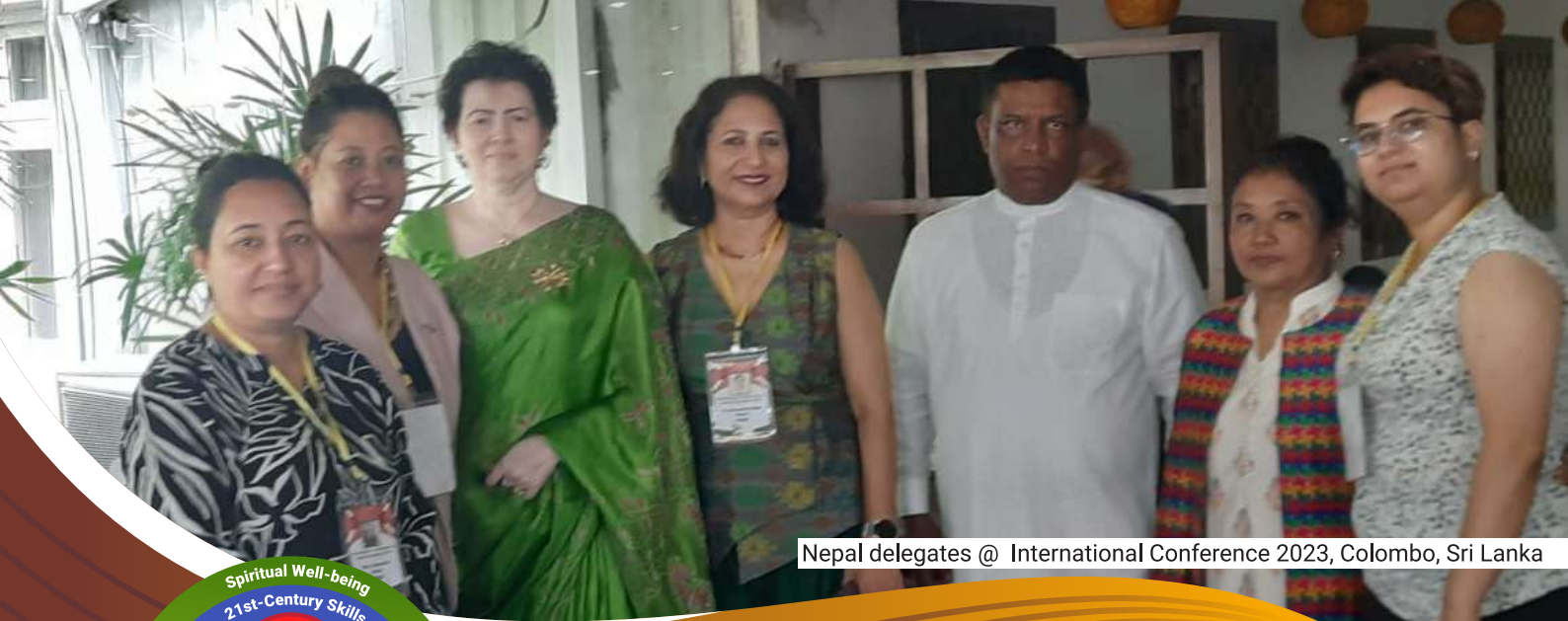
Nepal delegates @ International Conference 2023, Colombo, Sri Lanka