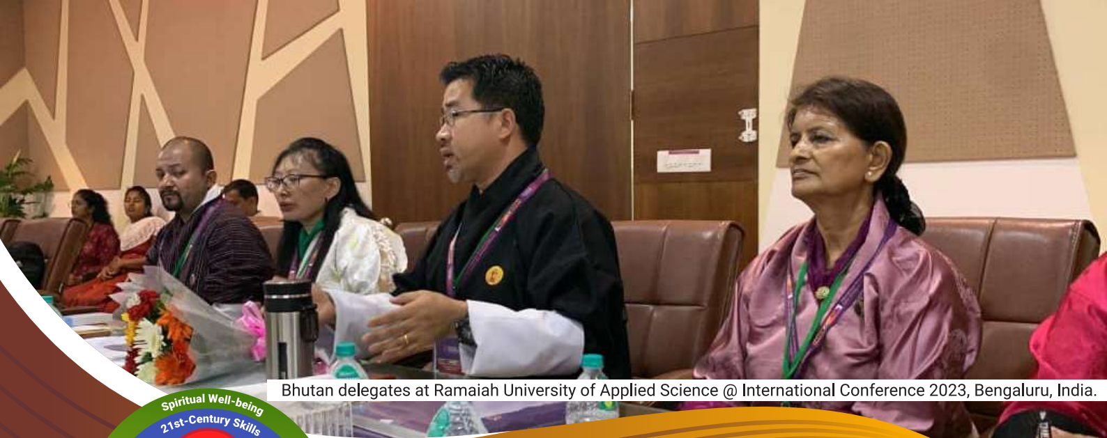
Bhutan delegates at Ramaiah University of Applied Science @ International Conference 2023, Bengaluru, India.