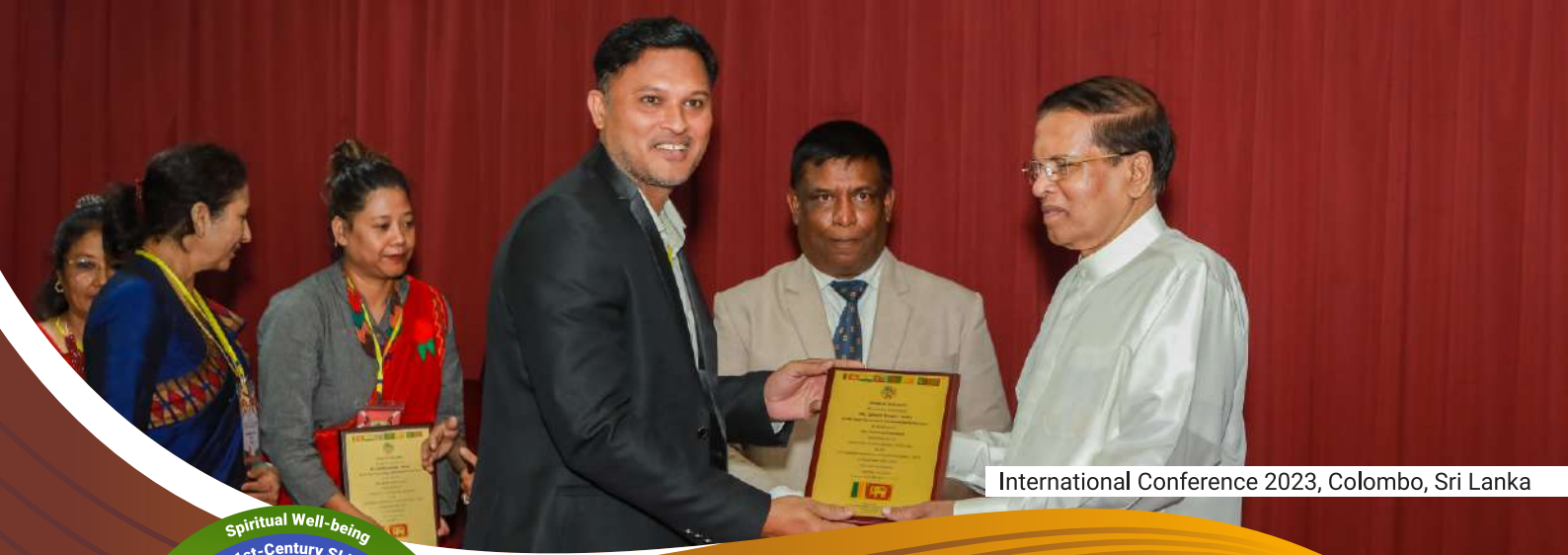
International Conference 2023, Colombo, Sri Lanka