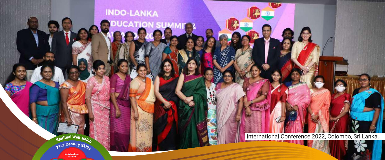
International Conference 2022, Colombo, Sri Lanka.