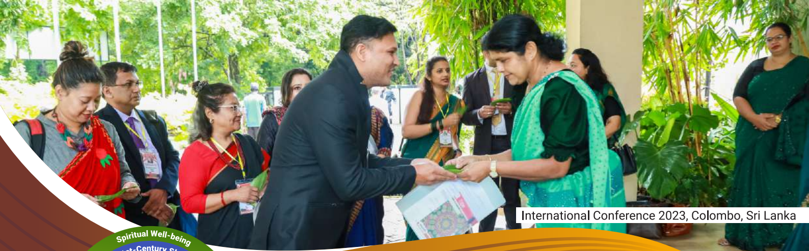
International Conference 2023, Colombo, Sri Lanka