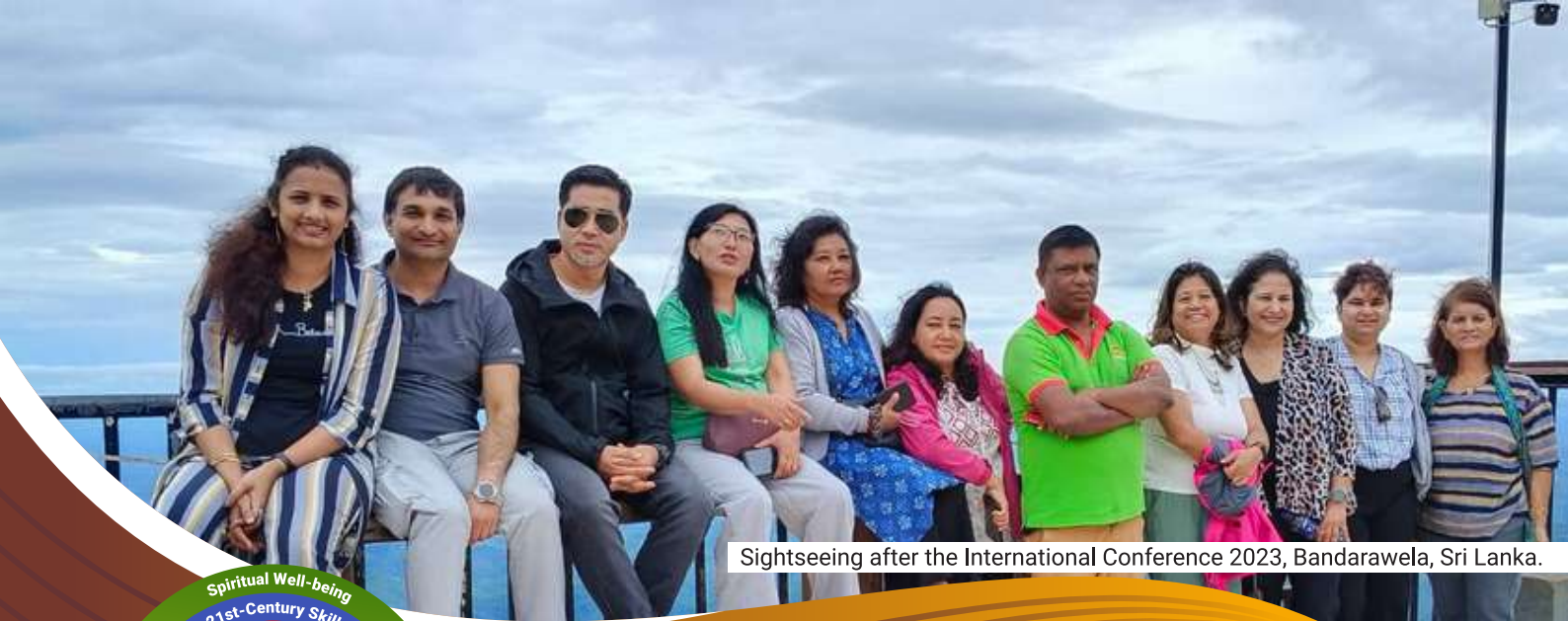
Sightseeing after the International Conference 2023, Bandarawela, Sri Lanka.