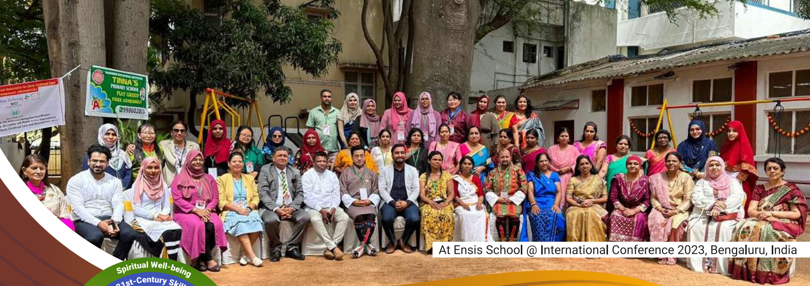
At Ensis School @ International Conference 2023, Bengaluru, India