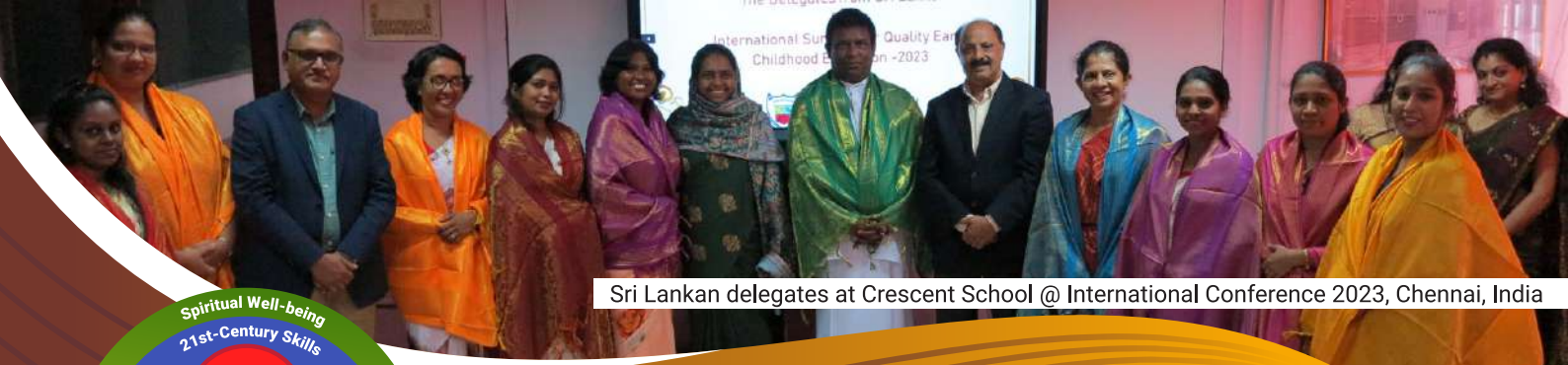
Sri Lankan delegates at Crescent School @ International Conference 2023, Chennai, India